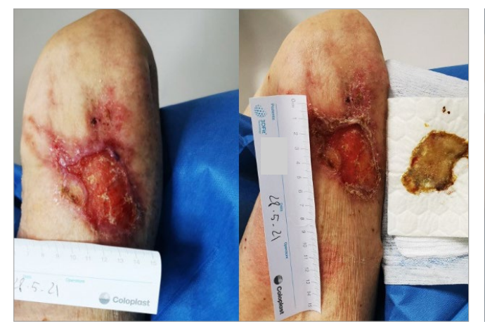
Figure 5. Day 29 of treatment

During the evaluation period using Biatain Fiber and Biatain Silicone for the treatment of the forearm burn, there was a reduction in wound size and islands of re-epithelialisation had begun to develop. Periwound maceration had resolved and there were no signs of inflammation or infection. Biatain Fiber efficiently managed and retained a high volume of exudate to form a cohesive gel both in the first phase of healing when the exudate was of a thick consistency, and in the second phase, when the exudate was of a thinner consistency. The dressing regimen of Biatain Fiber and Biatain Silicone was well tolerated by the patient; it did not cause pain and did not limit her movements, so the patient was able to continue her lifestyle and social relationships as before.