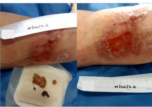
Figure 6. Day 43 of treatment

During the evaluation period using Biatain Fiber and Biatain Silicone for the treatment of the forearm burn, there was a reduction in wound size and islands of re-epithelialisation had begun to develop. Periwound maceration had resolved and there were no signs of inflammation or infection. Biatain Fiber efficiently managed and retained a high volume of exudate to form a cohesive gel both in the first phase of healing when the exudate was of a thick consistency, and in the second phase, when the exudate was of a thinner consistency. The dressing regimen of Biatain Fiber and Biatain Silicone was well tolerated by the patient; it did not cause pain and did not limit her movements, so the patient was able to continue her lifestyle and social relationships as before.