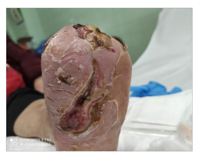
Figure 1. Initial assessment by wound care specialist before debridement (Day 1)