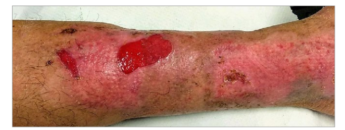
Figure 6. Day 43 of treatment