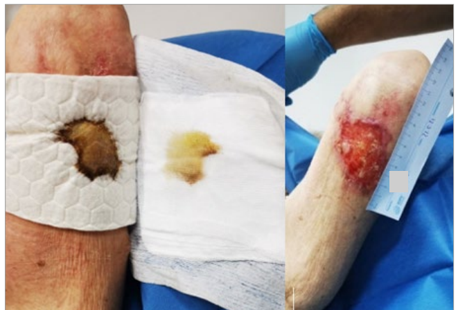
Figure 4. Day 22 of treatment