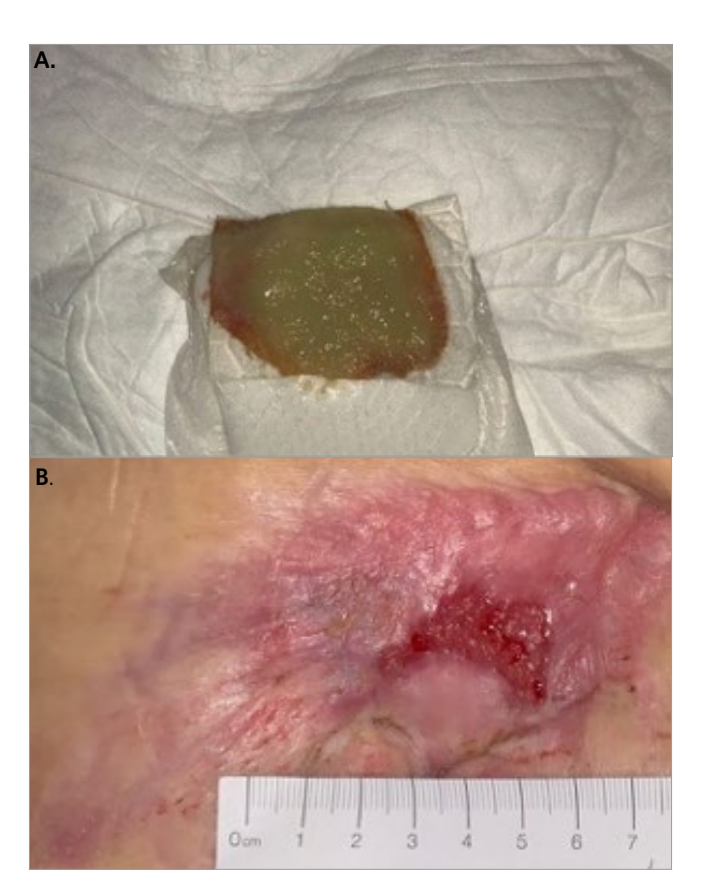
Figure 4. Day 48 of treatment