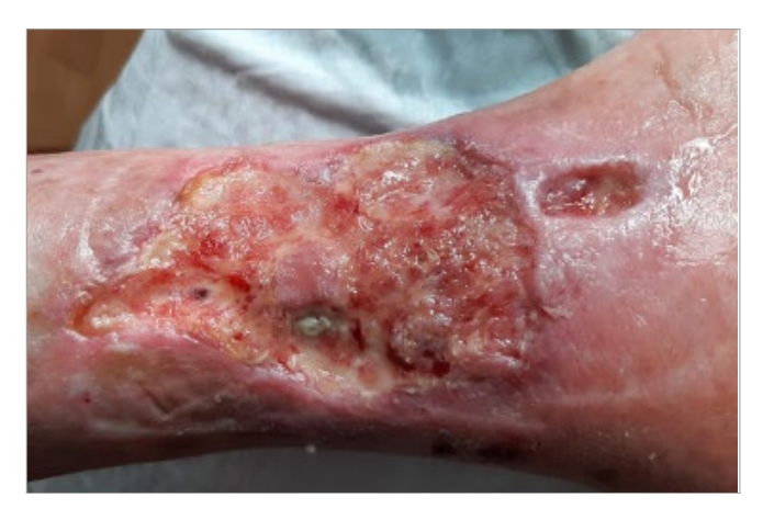
Figure 1. Initial assessment by the wound care specialist

Scores range from 0 to 100, and several authors have proposed guidelines for interpreting Barthel scores. Shah et al (1989) suggest that scores of 0-20 indicate "total" dependency, 21-60 indicate "severe" dependency, 61-90 indicate "moderate" dependency, and 91-99 indicates "slight" dependency.