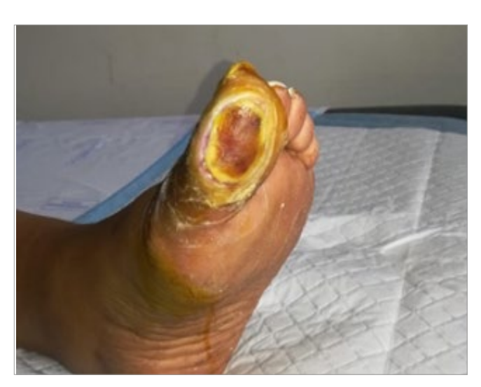
Figure 1. First day of treatment with Biatain Fiber dressing

The wound was debrided with an enzymatic debriding gel, but wound moisture increased. Therefore, it was important to choose a dressing that would minimise the risk of maceration to the periwound skin. Biatain Fiber 10 cm x 10 cm was used as the primary wound dressing to manage the wound moisture and was held in place by Biatain Foam Non-Adhesive 10 cm x 10 cm (Coloplast). A 'football' dressing technique was used to offload the ulcer ( Box 1 ; Rader and Barry, 2008). Consultations and dressing changes were planned for twice weekly. The patient was prescribed a broadspectrum short course of co-amoxiclav 1g twice daily for 7 days.