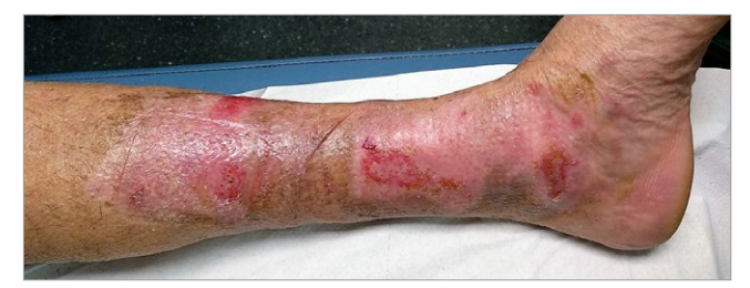
Figure 5. Day 28 of treatment