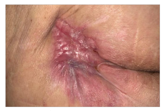
Figure 5. Day 92 of treatment