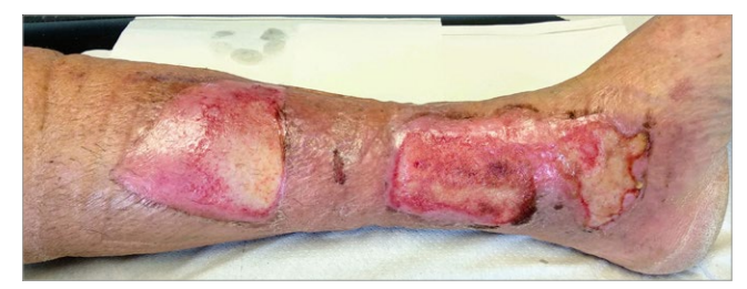
Figure 4. Day 10 of treatment