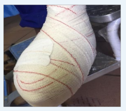
Example of the 'football' dressing technique used on a forefoot ulcer

A semi-compressed felt material that complements the patients' foot type and/or wound location can be added to the offloading sandal or beneath the foot.