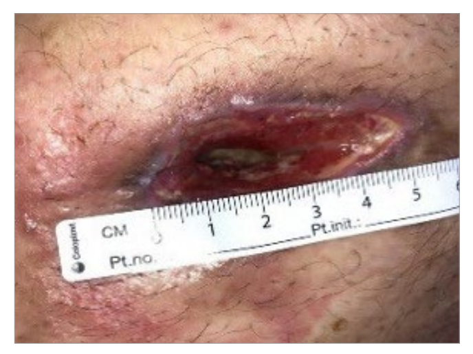
Figure 1. Initial assessment by the wound care specialist (Day 1)