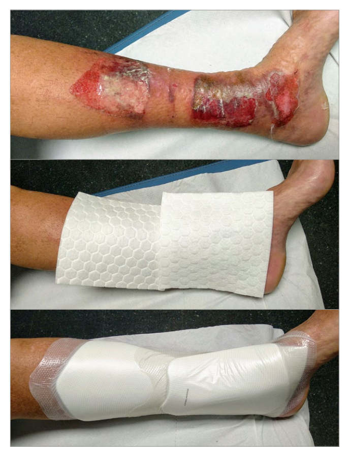
Figure 2. Day 1 of treatment with Biatain Fiber dressing - after cleansing and debridement

In the emergency department, the patient was prescribed paracetamol 650 mg every 6-8 hours. As the pain remained elevated and constant, he was also prescribed tramadol 50 mg at night.