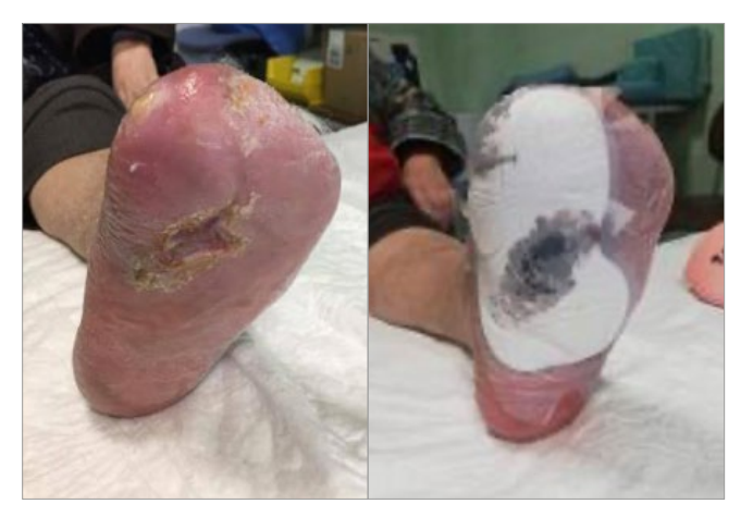
Figure 3. Day 42 (6 weeks) of treatment