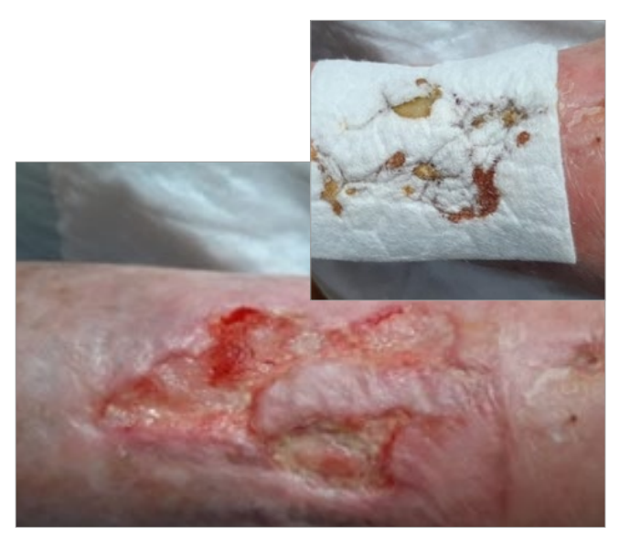
Figure 3. 2 month of treatment