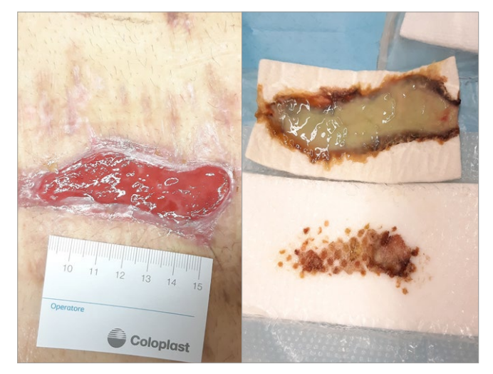
Figure 3. 34 days of treatment with Biatain Fiber and Biatain Silicone

The wound in this case evaluation was a deep cavity wound, which was infected with multiple bacterial strains. Once the clinical signs of infection were resolved, the wound was at high risk of re-infection. Biatain Fiber dressing was selected to absorb and retain the exudate, thereby removing the residual bacterial load from the wound bed. The combination of Biatain Fiber and Biatain Silicone effectively reduced the amount of exudate pooling in the wound bed, protected against maceration of the periwound skin, and managed the residual microbial load present on the wound bed. Biatain Fiber formed a soft gel when in contact with fluid, was not observed to shrink in the wound and remained intact on removal. The removal of the dressing was always simple and atraumatic, preventing the patient from experiencing pain.