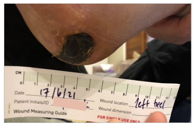
Figure 1. Initial assessment

The aim of treatment was to avoid hospital admission and prevent wound infection; treatment would include debridement, creating a moist wound environment, and offloading pressure to the heel. The necrotic 'cap' was debrided with a sterile blade. The depth of the wound was still unknown due to extensive amount of devitalised tissue present. The wound was mechanically debrided with the Alprep® Pad cleansing and debridement pad (Coloplast). An antimicrobial soak was used and a barrier film was applied to the periwound area, a moisturedonating gel dressing to the wound area and a heel-shaped foam dressing with a silicone border. Corticosteroid ointment was applied to the area of contact dermatitis.