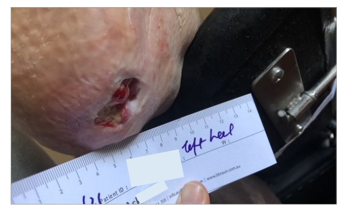
Figure 4. 43 days of treatment with Biatain Fiber (Wound size: 0.99cm<sup>2</sup>)