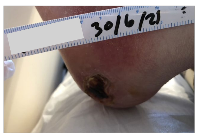
Figure 2. 2 weeks of treatment (Wound size: 4.53cm<sup>3</sup>)