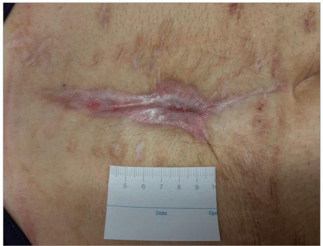
Figure 4. Complete wound closure with scar being remodeled (Day 65)

The wound treatment plan also helped to manage the malodourous nature of the wound; therefore, the dressings could be changed less frequently, which had a positive impact on the patient's quality of life. The conformability of Biatain Fiber and Biatain Silicone to the patient's abdominal wound and body contours assured that the patient's movements were not limited, allowing her to carry out the normal activities of daily life.