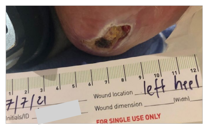
Figure 3. 3 weeks of treatment – Day 1 of Biatain Fiber (Wound size: 2.98cm<sup>2</sup>)