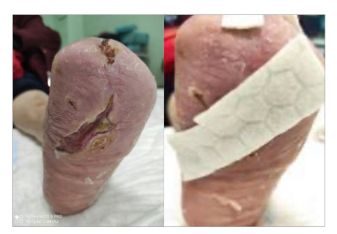
Figure 2. Day 26 of treatment