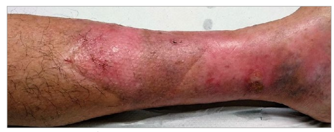
Figure 7. Day 71 of treatment