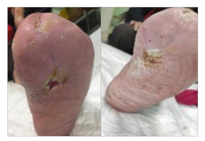
Figure 4. 3 months of treatment